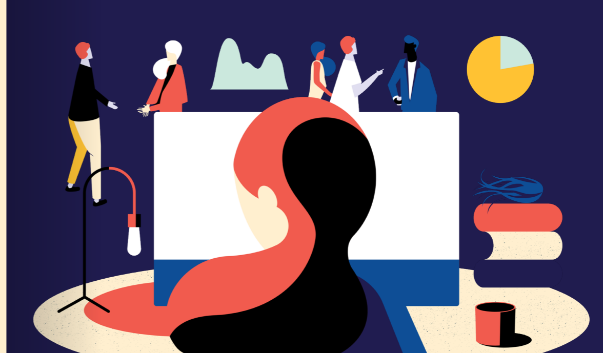
Individuals need to be able to quickly switch between team collaboration and individual focus work.