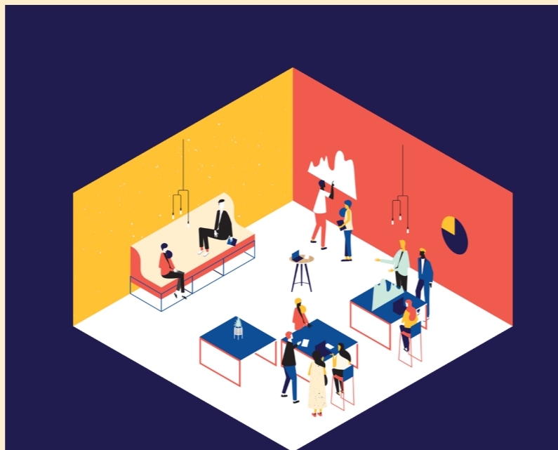
Teams need a home where they can foster a sense of identity, cohesion and trust.