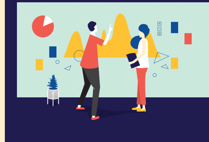
Teams and individuals need to feel empowered to reconfigure the space on their own as work flows and changes throughout the project.