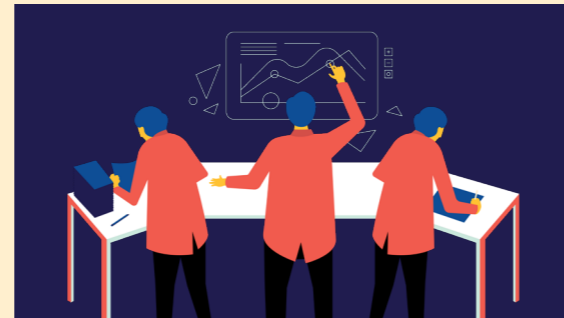
People need the ability to quickly toggle between digital and analog tools for thinking, creation and collaboration.