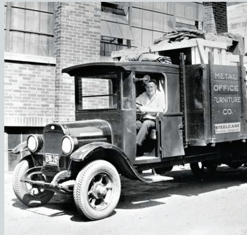
Established in 1912 as the Metal Office Furniture Company.