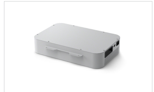
APC™ Charge Mobile Battery

*APC™ Charge Mobile Battery and Microsoft Surface Hub 2 sold separately.